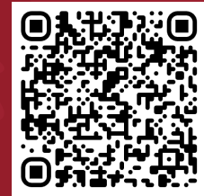
Living in Hamilton