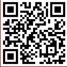
Sacred Heart Girl's College